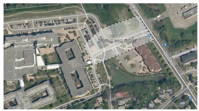
Map of area.

• Light posts will be installed along both sides of the road entering Perley Health.