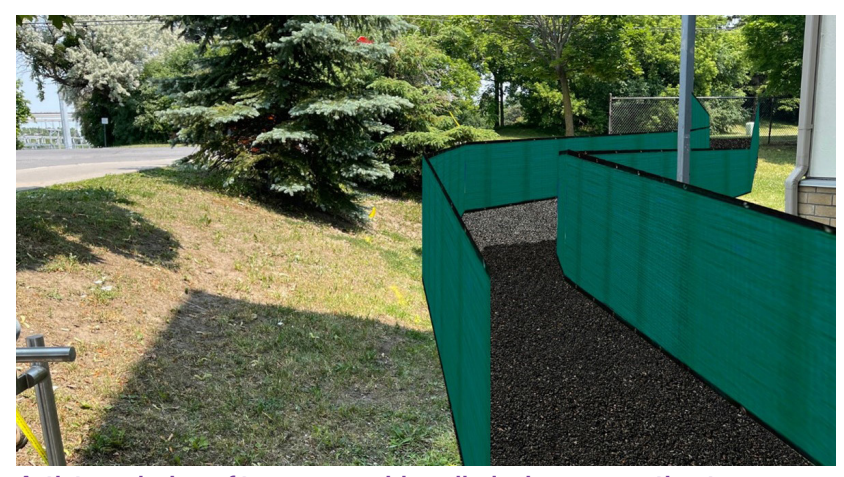
Artist rendering of temporary sidewalk design connecting to Russell Road.