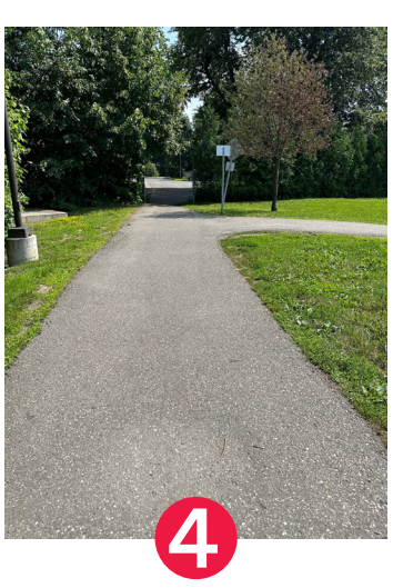
Property exit to Pullen Ave.