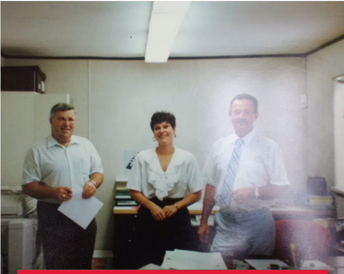
This woman was a member of the Perley/Norr Site Team at the time of the Health Centre's construction, and is a current staff member. Can you name her?