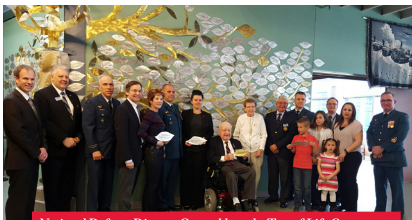
National Defence Director General hosted a Tree of Life Ceremony to honour three Veterans. This year, the members of DGAEPM raised $9,416 for the purchase of three Broda Chairs.