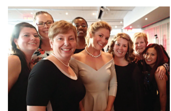
Sophie Grégoire-Trudeau is surrounded by some of Perley Rideau's VIPs attending the recent CNF's Nightingale Gala