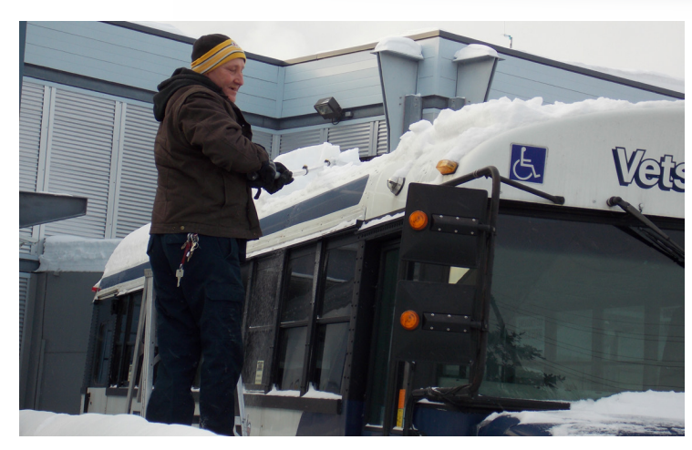
Ottawa's version of a February Car Wash!

Thanks for your support and patience as staff make these changes.