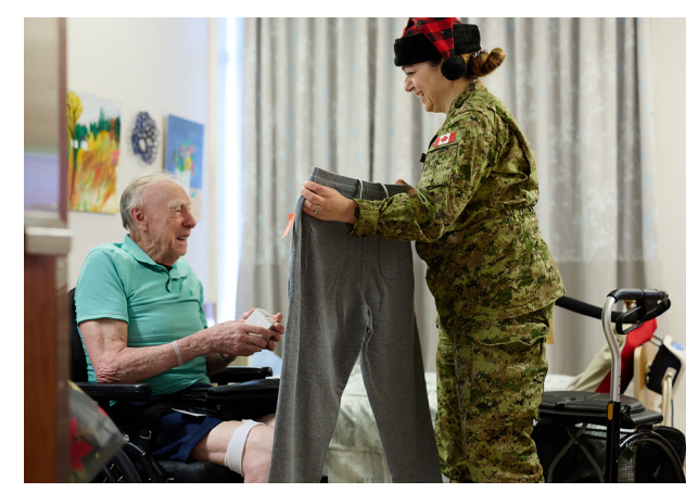
Smiles for Seniors spent the afternoon with Seniors and Veterans, delivering gifts and well-wishes on behalf of the Canadian Forces. Smiles for Seniors has been participating in this tradition with local long-term care homes since 2000, and continues to make our season bright.

Learn more about how each of these groups made our days merry and bright, and check out more photos from each event on the Perley Blog by visiting: