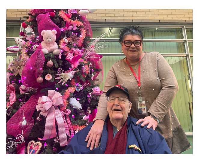
Nurse Next Door transformed the Main Hallway with a stunning pink Christmas tree that's become the heart of the Perley community. Residents, tenants, staff, volunteers, and friends and loved ones are loving the display; it's become quite a hot spot for photos and conversation!