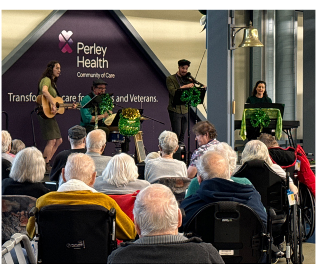
March: The Therapeutic Recreation and Creative Arts team put on a spectacular event for St. Patrick's Day for lucky Perley Health residents.