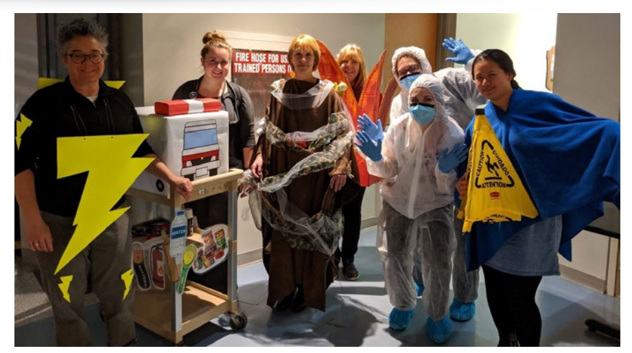
Members of the Safety Week Planning Committee dressed as the following natural disasters and emergency personnel for the Halloween costume party: (from left to right) lighting, ambulance, tornado, fire, disaster recovery team and flood.

Since progressive discipline is not mechanical, steps in the sequence can be skipped or repeated, depending upon the facts and circumstances, including the seriousness of the culpable behaviour. All discipline on the employee's file will be considered when determining the appropriate