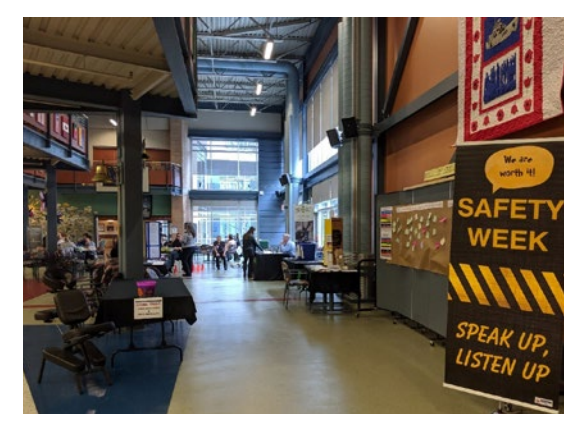
We had a Wellness Celebration on Friday which is filled with fun learning activities, games and lots of education materials. Some of our partners joined this celebration such as the Dementia Society, Interprofessional Clinic and our new Employee Assistance Program – Family Services. Thanks to the Physio and Massage clinic for free massages!

disciplinary action. The length of time a disciplinary document remains on the employee file is subject to the collective agreement; both the ONA and CUPE collective agreements provide that discipline will be removed from the file 18 months from its imposition (see collective agreements for details).