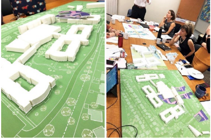
Figure 1 Pre-design Workshops

We are currently in the early stages of schematic design which will finalize the program and layout of the podium level and explore the connections with the rest of the surrounding buildings. We are exploring design options that will support the Spiritual Health needs of our community and host all types of gatherings, both large and small. We also started working closely with the design team, stakeholders and the PR community to identify interim solutions that will ensure Spiritual Health and operational needs are met during the construction.