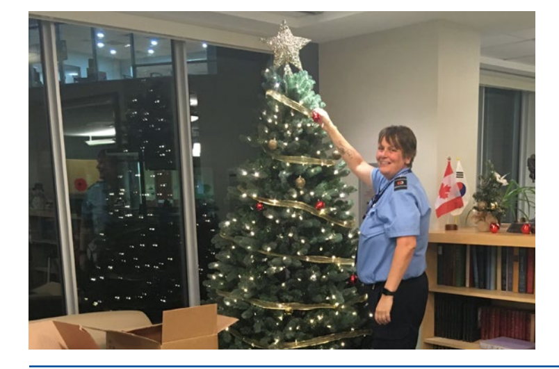
A this time of year, everyone pitches in to trim the trees. Can you guess how many decorated Christmas trees there are at Perley Rideau? See the back page for the number for this year.