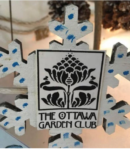
Thank you to the Ottawa Garden Club for their beautiful winter woodland critter display