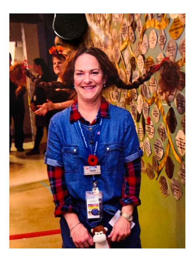
So, what kind of hair day are you having? Halloween 2019 fun!

The Answer – There are 36 Christmas Trees decorated in the Perley Rideau Village. And that does not include any trees in private apartments!