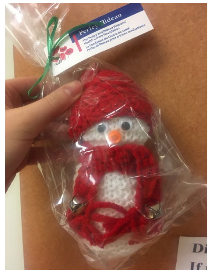
These adorable hand-made snowmen are on sale now in the Foundation office for $10 each! Only 12 remaining at the time of publication, don't wait to get yours!