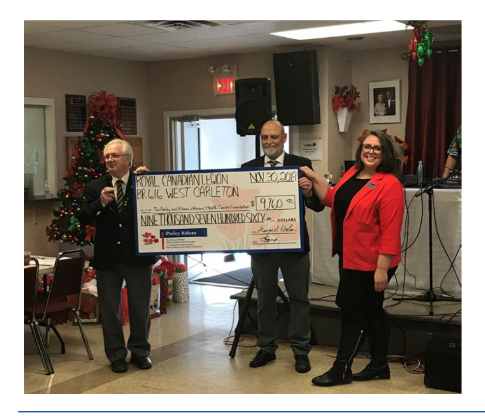
Thank you to members of the Royal Canadian Br. 616 – West Carleton for their generous donation of $9,760! This money will be used to purchase a new bladder scanner, which will perform quick, easy and non-invasive scans of the bladder to safely and accurately evaluate the need for catheterization. This money will also be used to fund the Home Sweet Home project, giving each resident room new curtains and comforter linens by the end of 2022. We are grateful to the Legion members for their ongoing support!