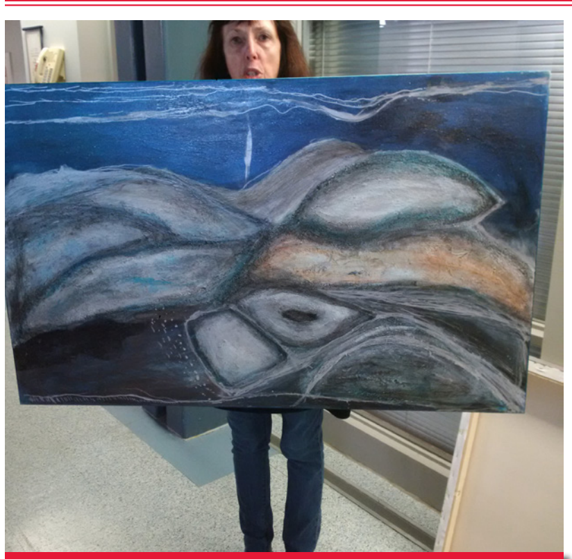
Created from memories of Newfoundland's rocks and the Atlantic's waves, the paint has just dried on this original from the Perley Rideau's talented residents. The painting now hangs in our boardroom. Sorry, but it won't be for sale.