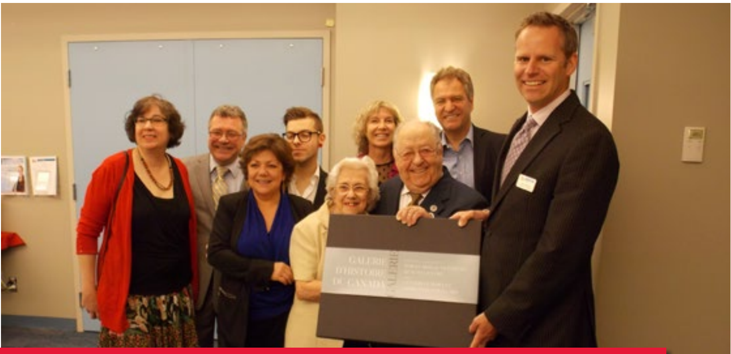
A generous donation from the Couillard family to Perley Rideau including 42 prints celebrating Canadian landmarks and milestones and preserved for almost 50 years. Thank you! Watch for the collection will be on display in the Perley Rideau art gallery in January 2016.