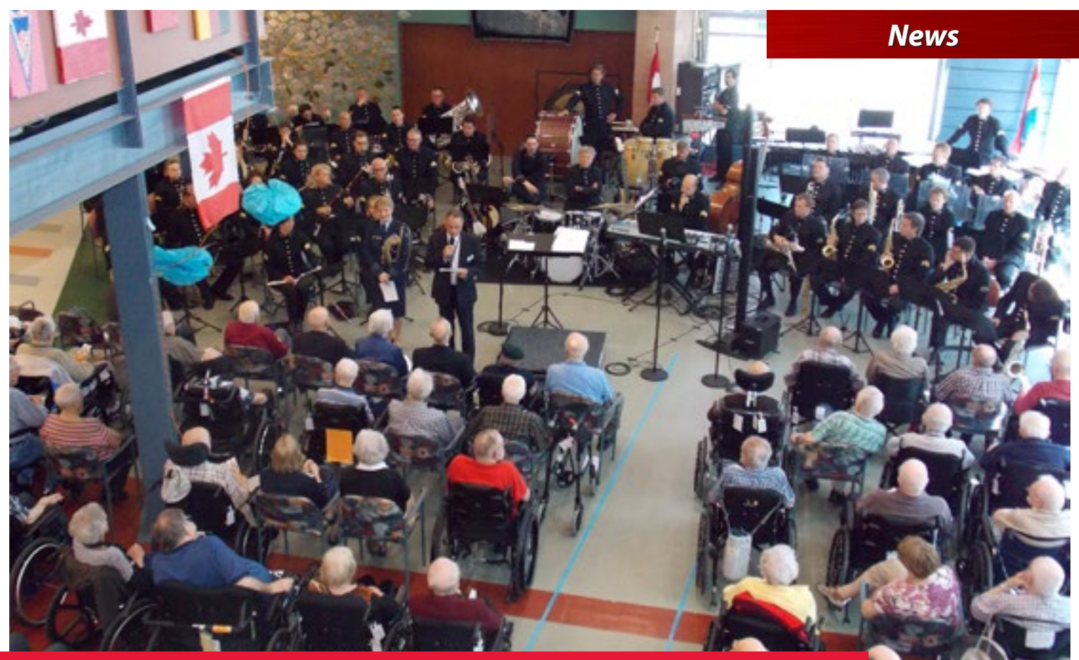
On May 26th, the 45-member Royal Netherlands Air Force Orchestra including singers visited Perley Rideau to perform a one-hour concert to commemorate the Liberation of the Netherlands in 1945. More than 30 Canadian veterans from the liberation who call Perley Rideau home were honored during the emotional concert.