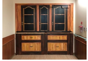
Artists Are Painting Trompe L'Oeil Murals to Soothe People with Dementia. Read more here:

https://www.artsy.net/article/artsy-editorial-artistspainting-trompe-loeil-murals-soothe-people-dementia Diversion mural by Andréa Fabricius.