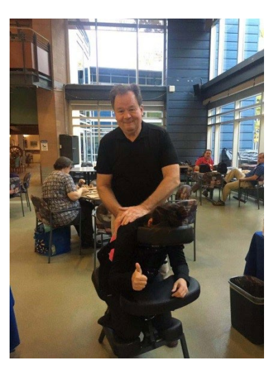
Also special thanks to the Perley Rideau Physio & Massage Therapy Clinic for providing staff with free massages!