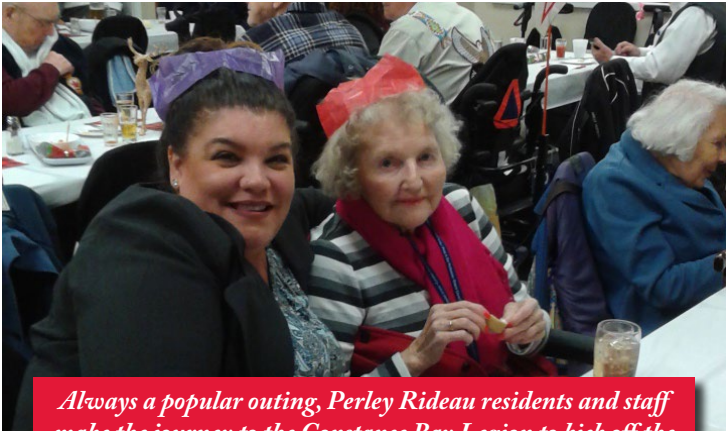
Always a popular outing, Perley Rideau residents and staff make the journey to the Constance Bay Legion to kick off the holiday season.