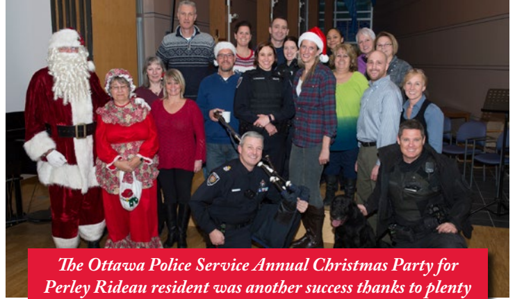
The Ottawa Police Service Annual Christmas Party for Perley Rideau resident was another success thanks to plenty of two-legged and four-legged support. Residents enjoyed the party and cherished the hand knitted gifts.