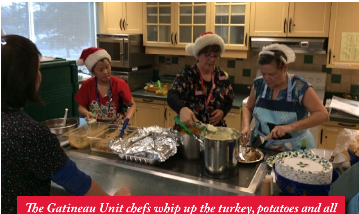
The Gatineau Unit chefs whip up the turkey, potatoes and all the fixings while spreading the Christmas cheer.