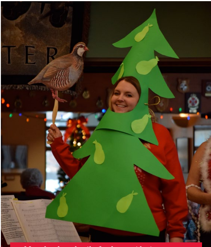
Many laughs and smiles for the partridge in a pear tree