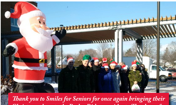
Thank you to Smiles for Seniors for once again bringing their Christmas cheer to the Perley Rideau residents. Thank you for your continued generosity!