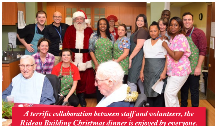
A terrific collaboration between staff and volunteers, the Rideau Building Christmas dinner is enjoyed by everyone. Thanks to all staff and volunteers for making the Christmas season so memorable.