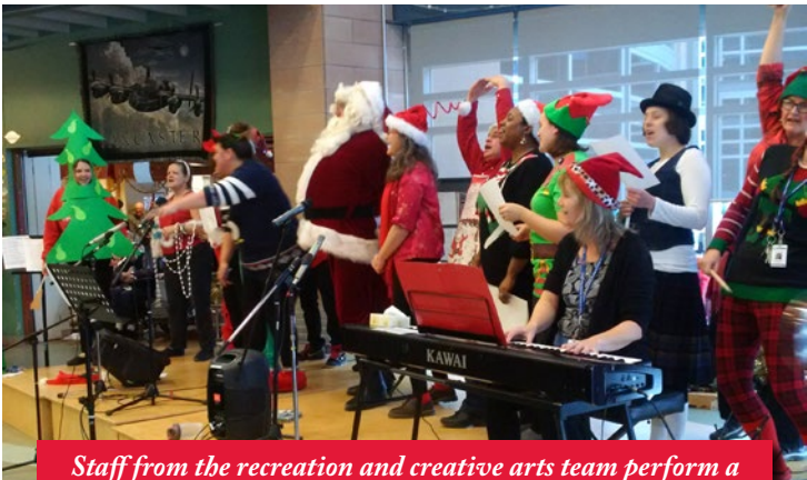
Staff from the recreation and creative arts team perform a unique interpretation of the 12 Days of Christmas.