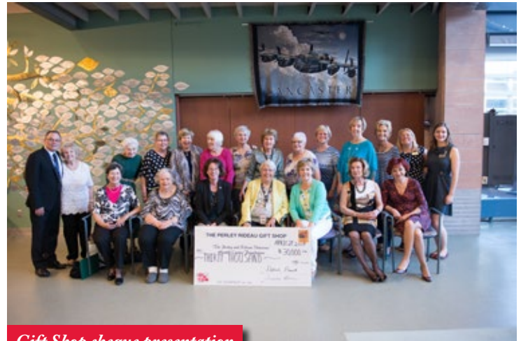
Gift Shop cheque presentation