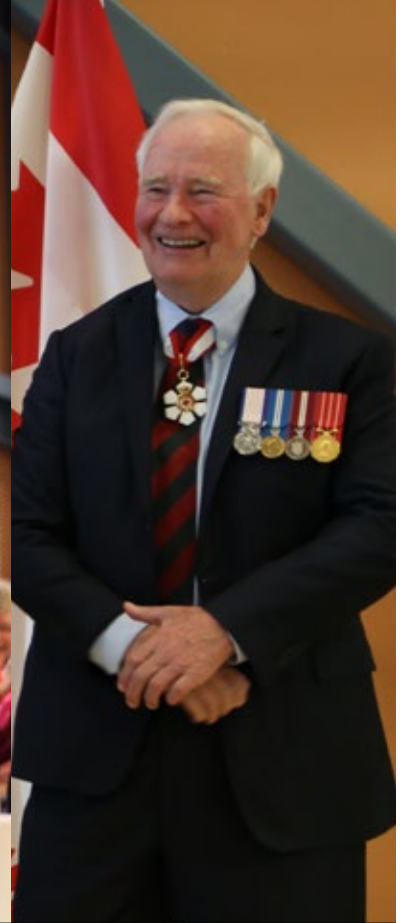
Governor General of Canada David Johnston