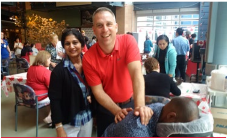
A Truly Relaxing Day: Members of the Perley Rideau Physio & Massage Team lend a hand – or two – by providing massages to staff during the luncheon.