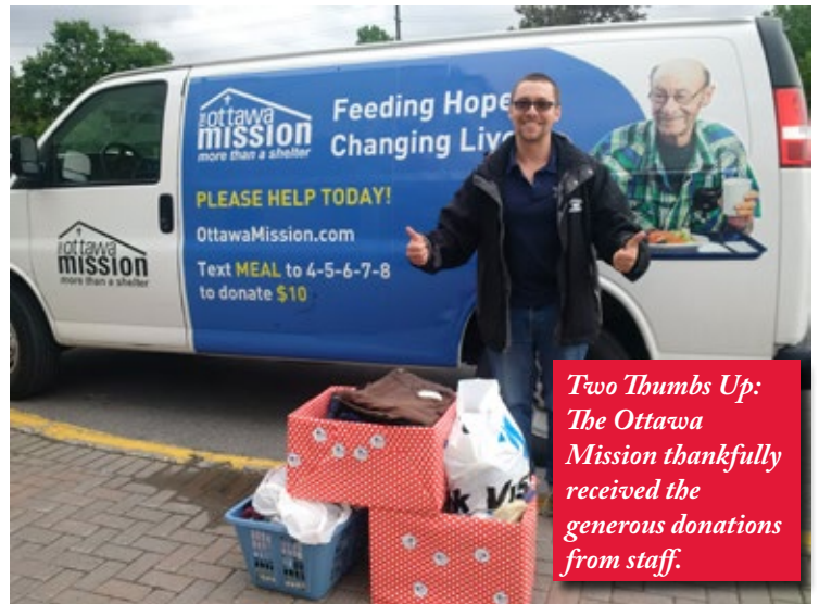
Two Thumbs Up: The Ottawa Mission thankfully received the generous donations from staff.