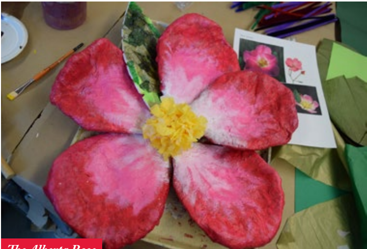
The Alberta Rose