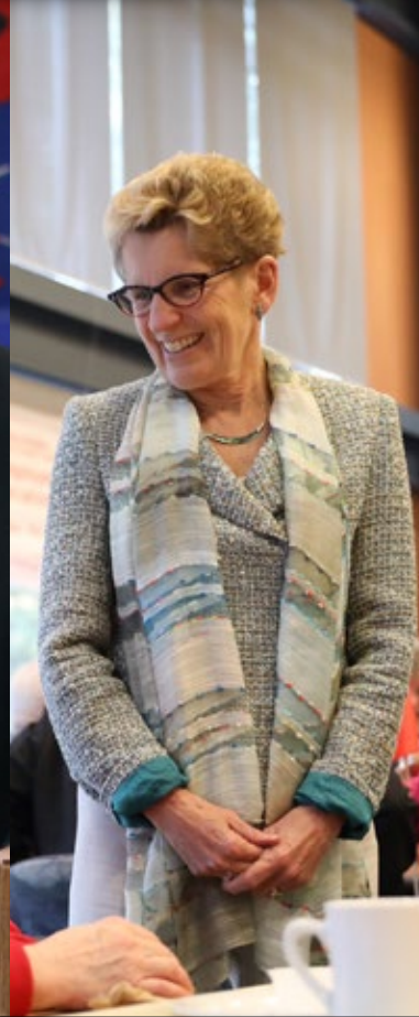
Premier of Ontario Kathleen Wynne