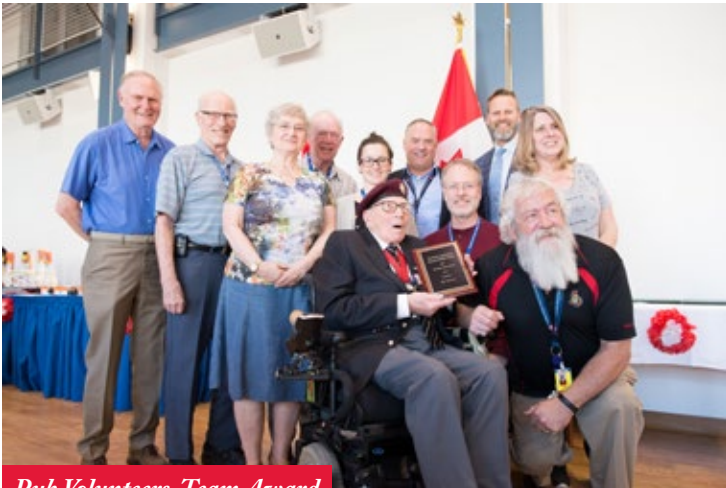
Pub Volunteers, Team Award