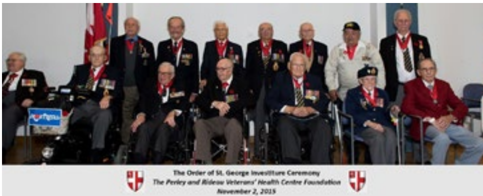
The Order of St. George Investiture Ceremony The Perley and Rideau Veterans' Health Centre Foundation November 2, 2015