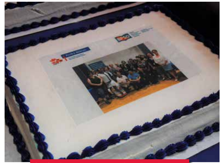
Staff and visitors were invited to cake and refreshments while networking and discussing the importance of quality care on resident's lives.